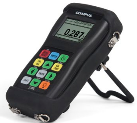
27MG with the optional Protective Rubber Boot with Neck Strap and Gage Stand

Standard inclusions may vary depending on your location. Contact your local distributor.