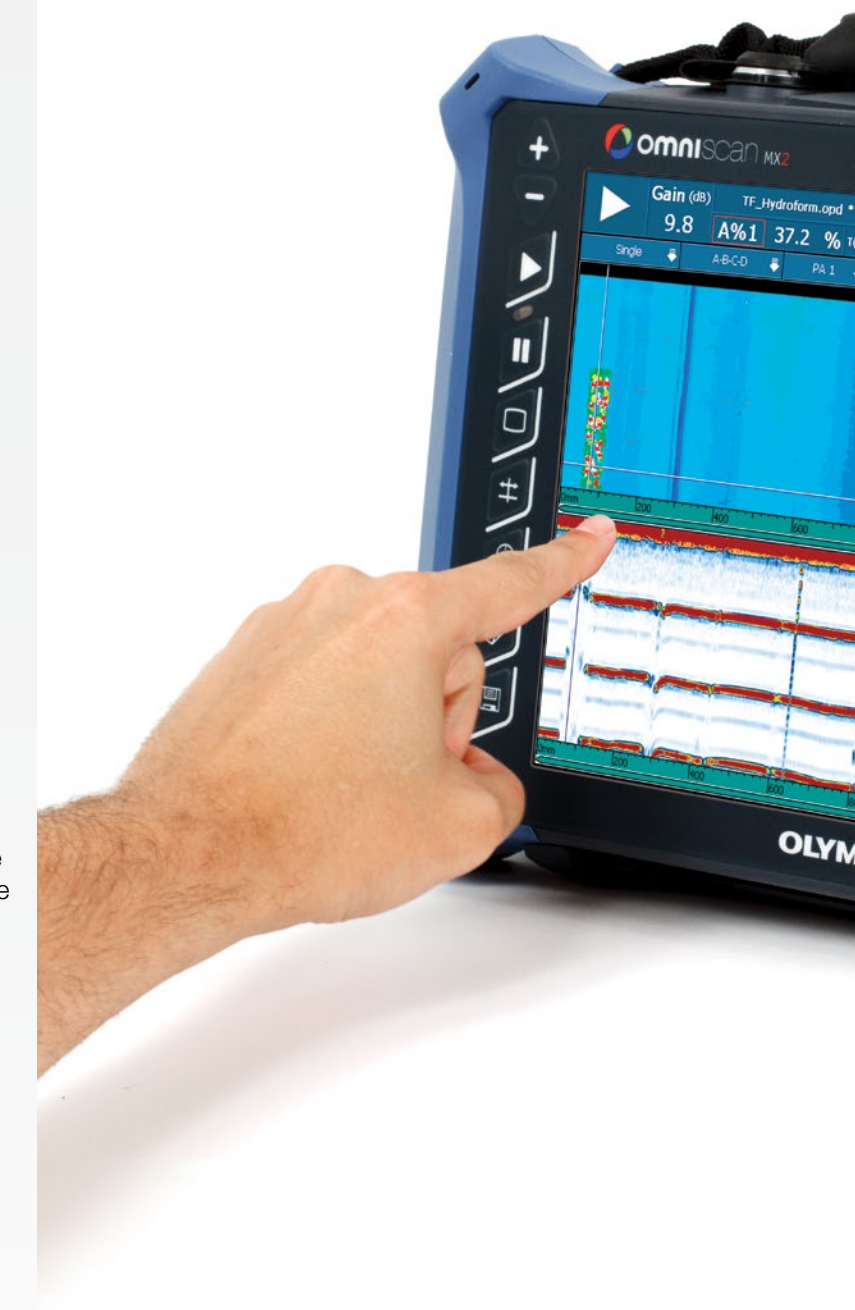
PA2 32:128 PA2 32:128PR